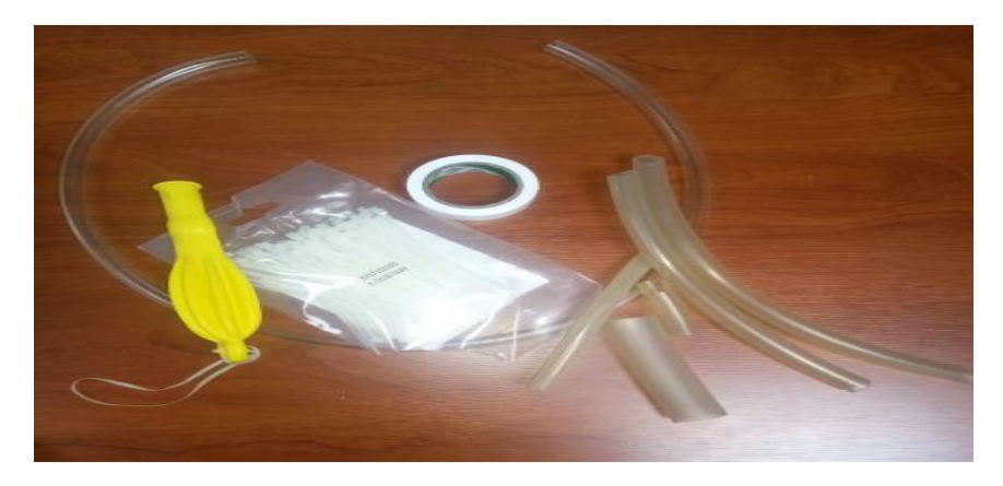
Related equipment and materials