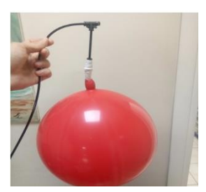
System gas supply element, balloon