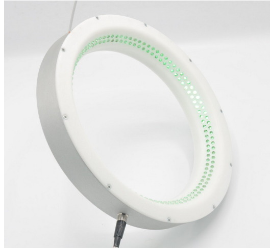
Figure 1. Dark Field DF22